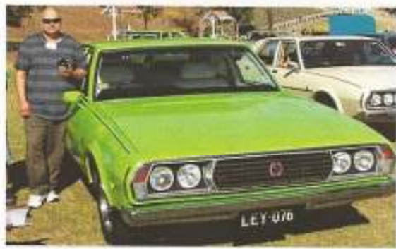
Best Modified (Runner-up)