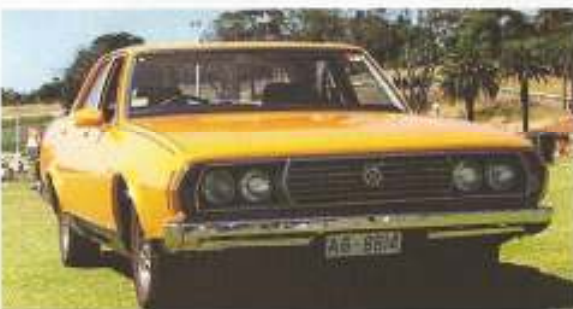
Best V8 (First Place)