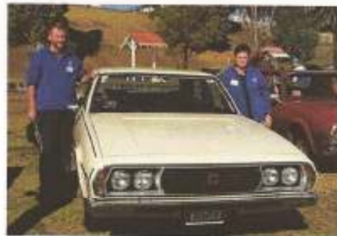
Best Original (Runner-up)