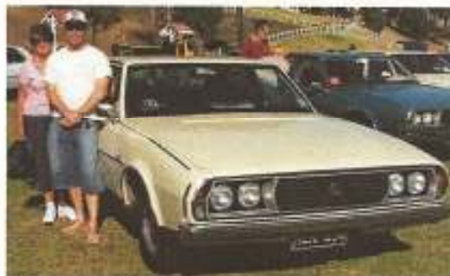
Best V8 (Runner-up)