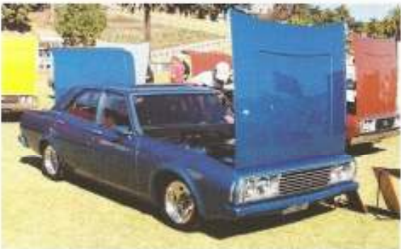
Best Modified (First Place)