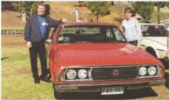
Best Original (First Place)