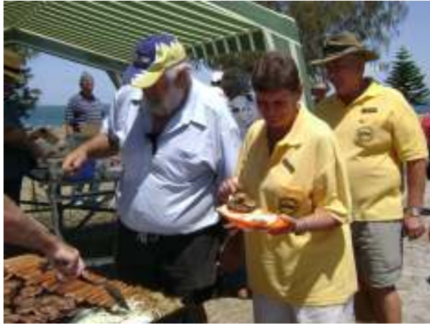
Looks good enough to eat