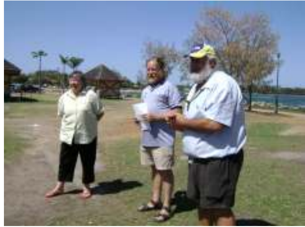
Presentation and raffles