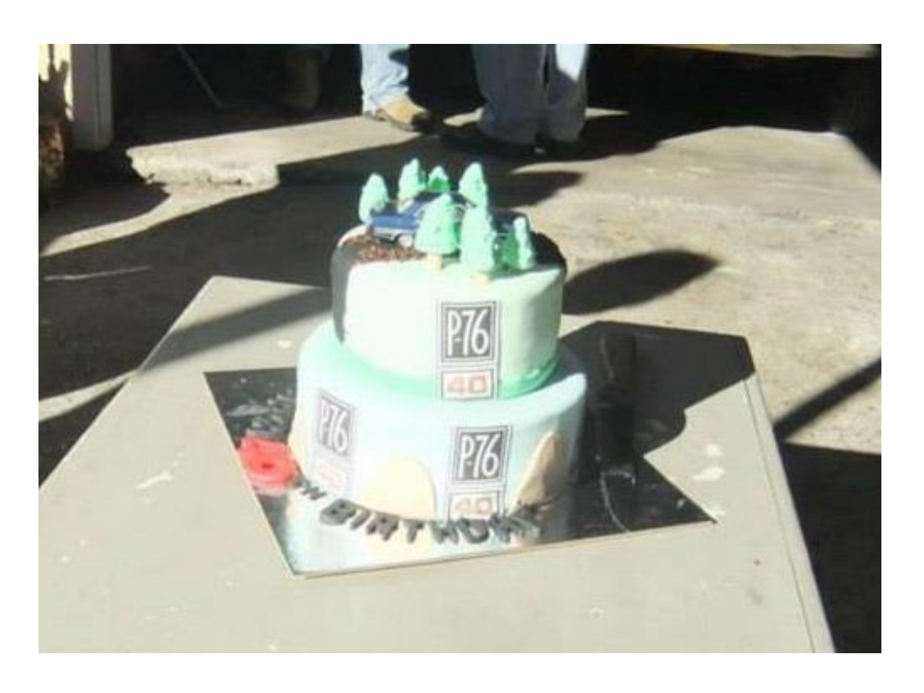
HUNTER VALLEY P76 CLUB TARGA FLORIO 40<sup>th</sup> Anniversary Celebration Cake.