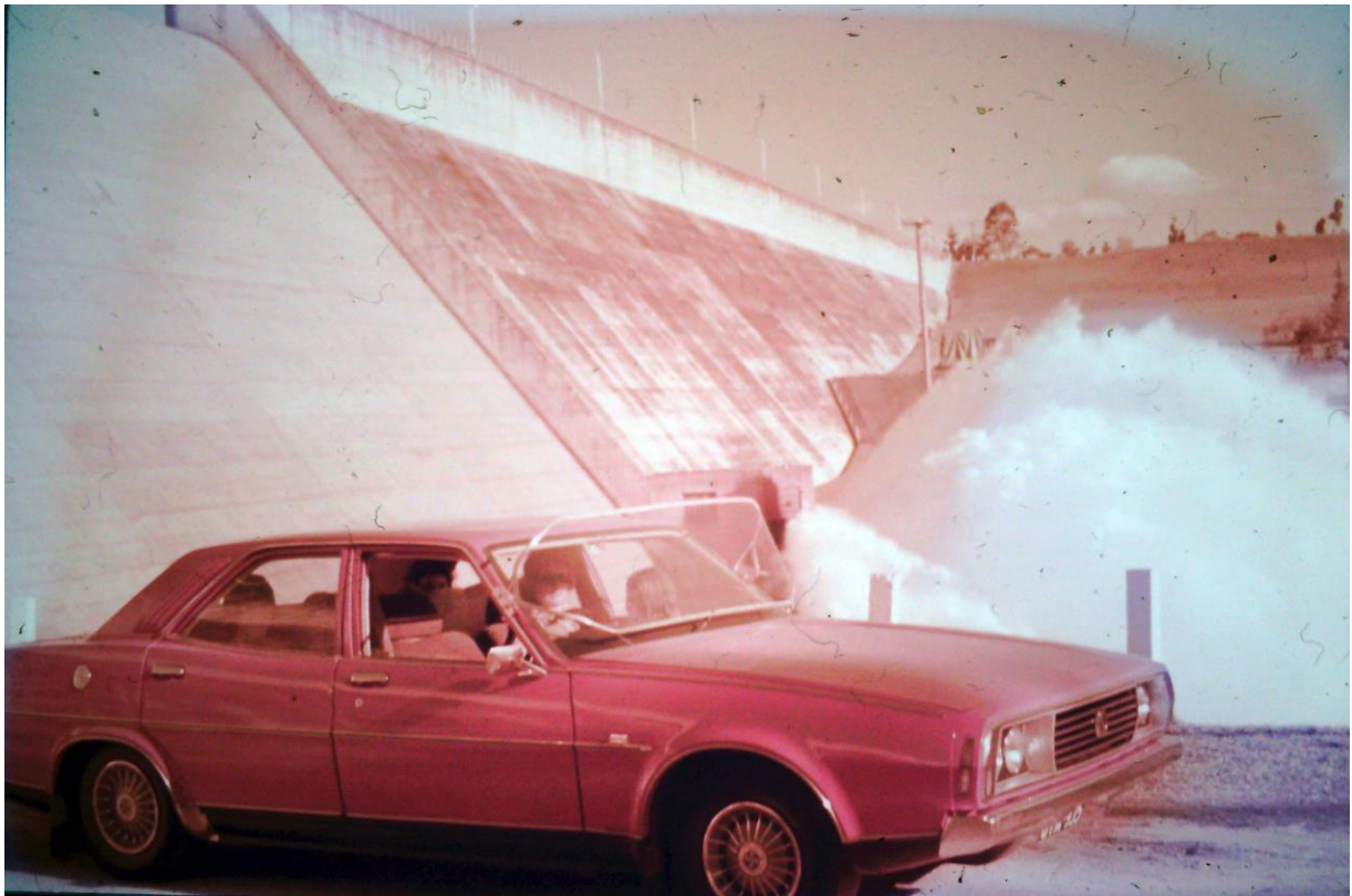
The “Bitter Apricot” at Tinaroo dam on the first trip to cairns, copied from a grainy old slide!