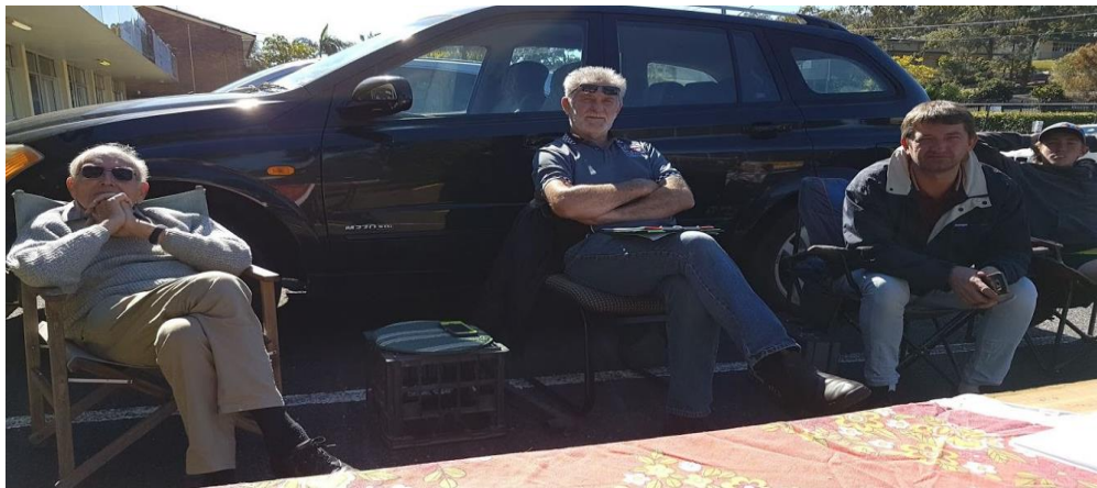
The usual attendees