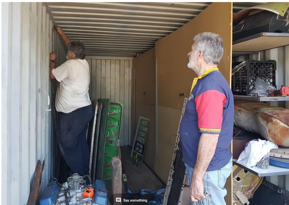
Tying down equipment in the container