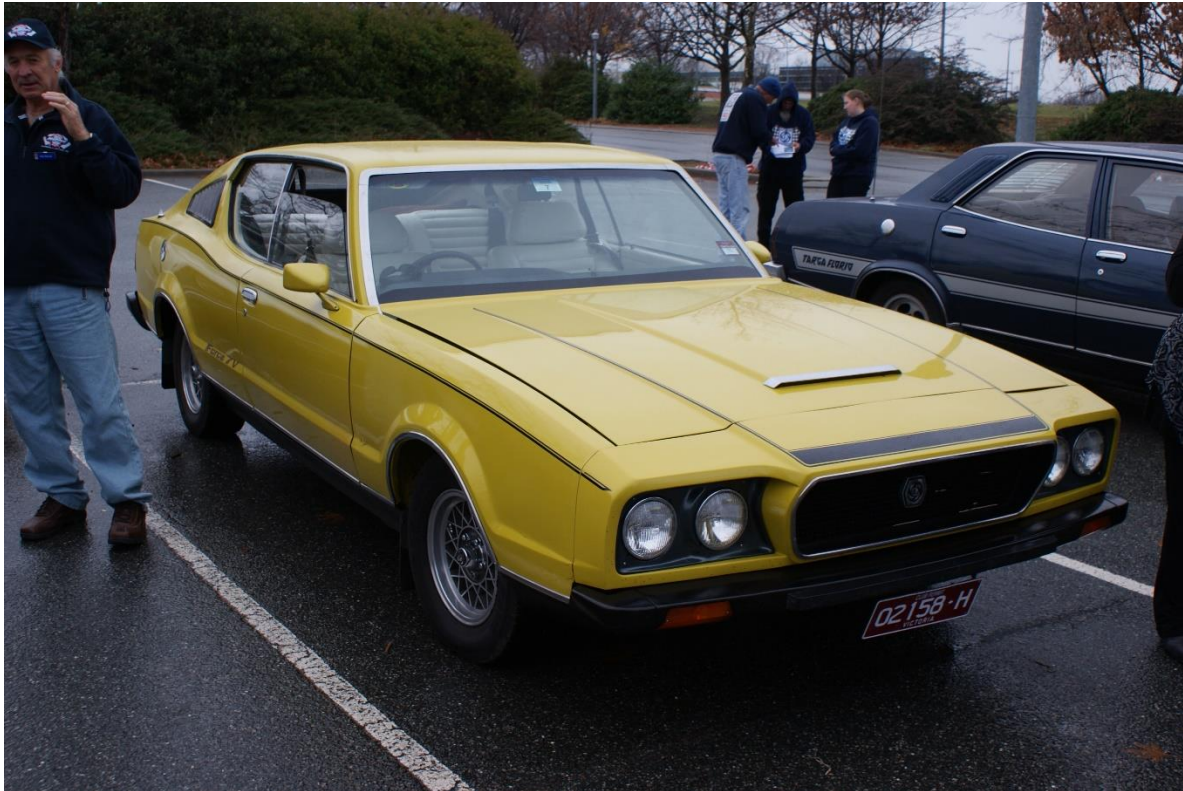
PHOTO TAKEN AT THE 40 TH IN CANBERRA IT WOULD BE NICE TO SEE SOME SPECIAL CARS AT NEXT YEAR'S NATIONALS

LEYLAND P76 OWNERS CLUB INCORPORATED QUEENSLAND P.O. Box 343, CARINA 4152, QUEENSLAND www.leylandp76.com