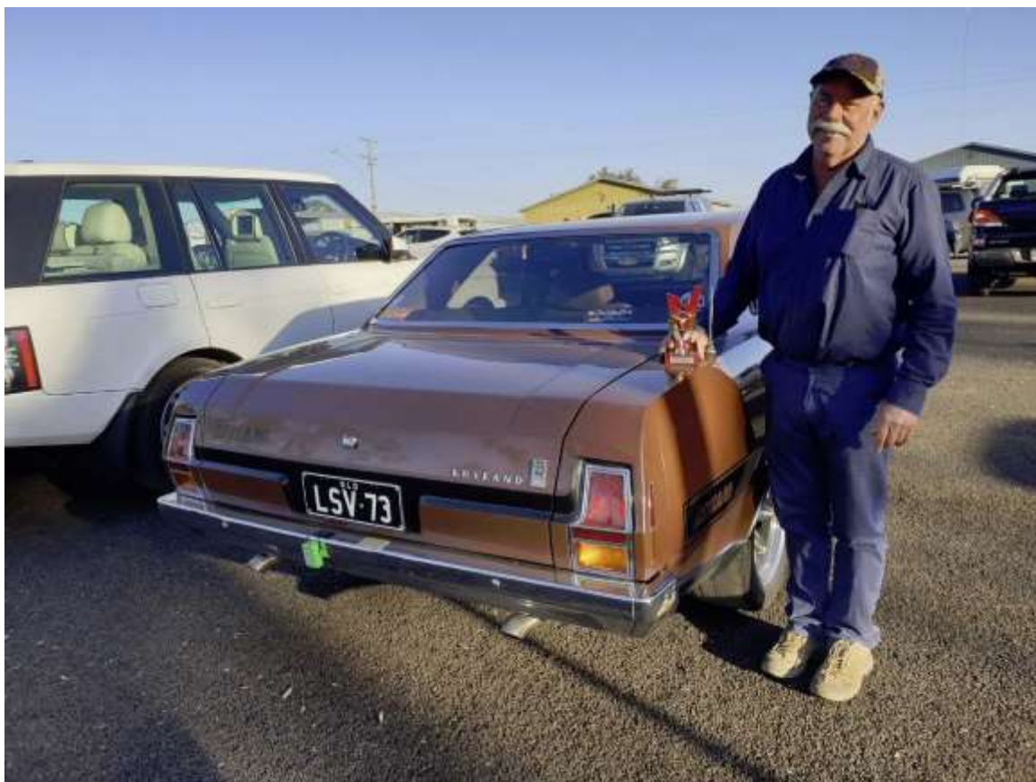
The Nationals are getting closer, don't forget to book your accommodation in Stanthorpe for the Easter nationals. Please see below the proposed Itinerary for the Nationals