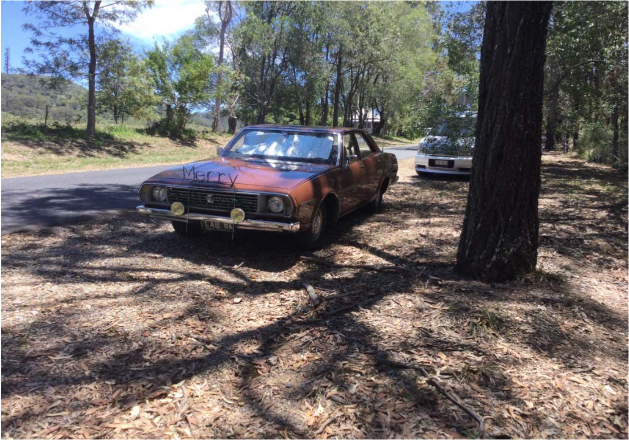
Merry Christmas greeting at the gate