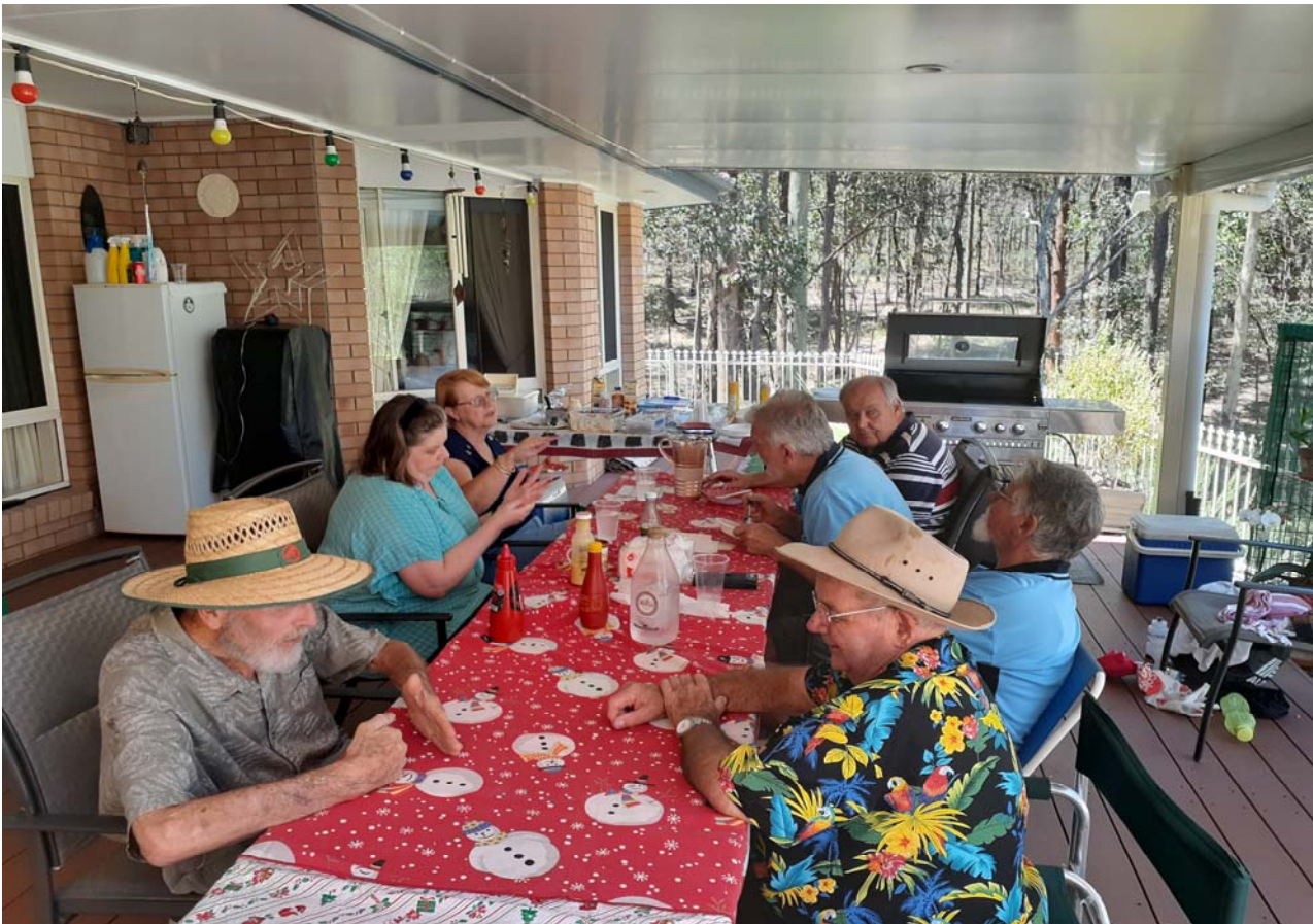
Plenty of important discussions around the table on how good the old "P" is and what could have been!