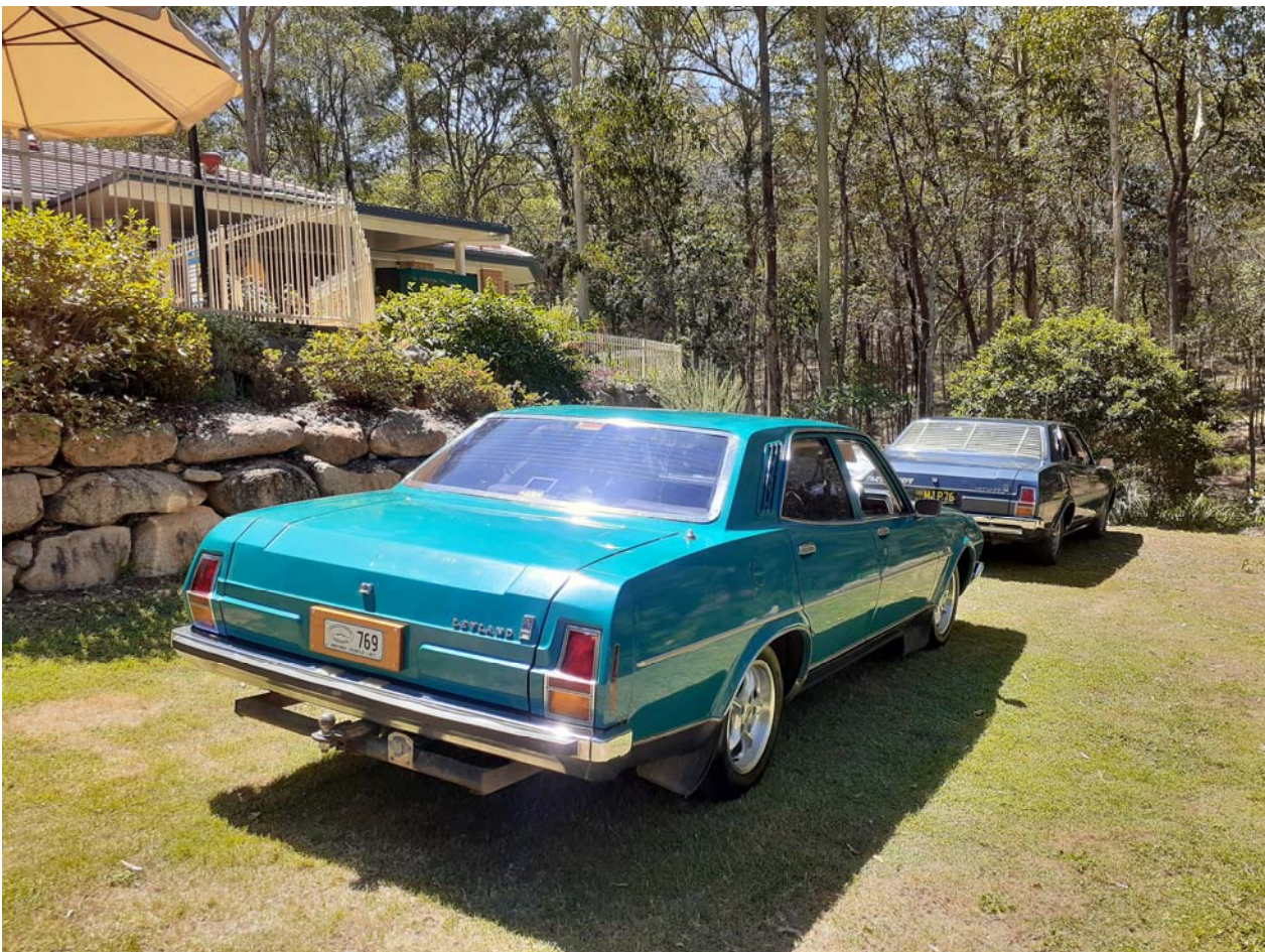
Looks good from any angle