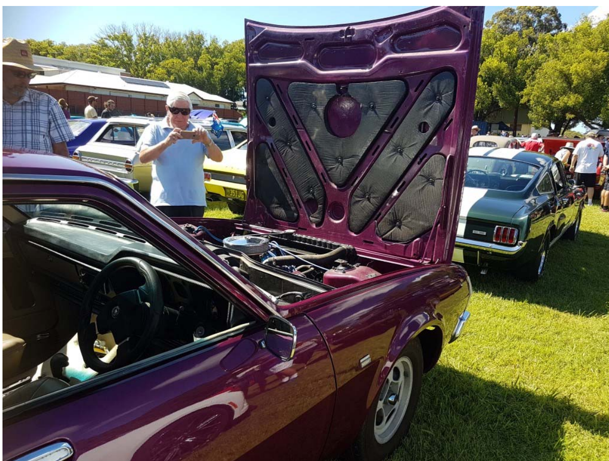
Australia Day Bayside vehicle restorers club display