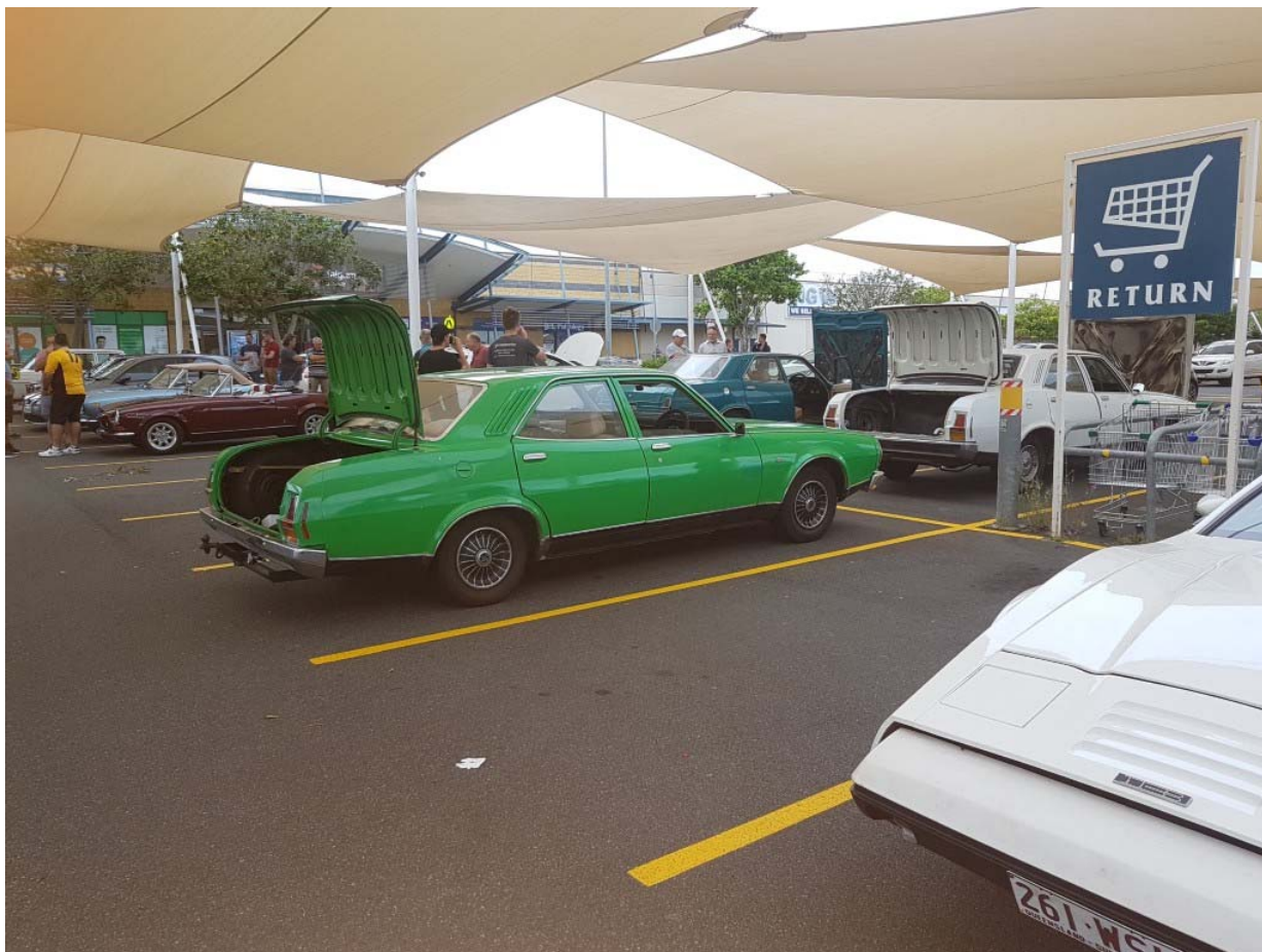
Showing off the big rear end!