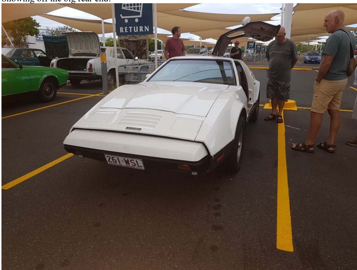
Some members on a run in February to Taigum, something different