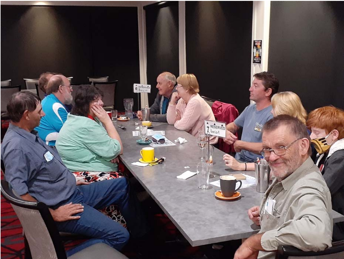
Out on the Road in Stanthorpe district, followed by a great night out at the Stanthorpe RSL